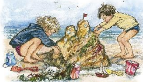
At the Seaside